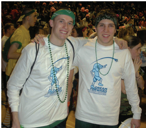
Skull House Dancers at THON 2009. Phi Kap Raised $15,000 toward this year's record total of $7.49 million.

First and foremost, we want to extend our most heartfelt thanks to the numerous alumni who have supported the re-chartering of Psi chapter the past few years. Yes, it's been quite a few years in the works! Without the vision, resolve, commitment, and dedicated support and involvement of alumni like