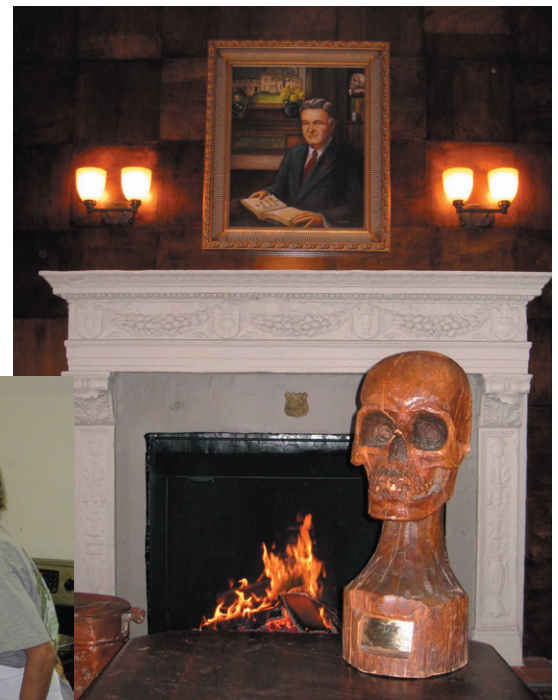
Above: Corky in front of the fire.