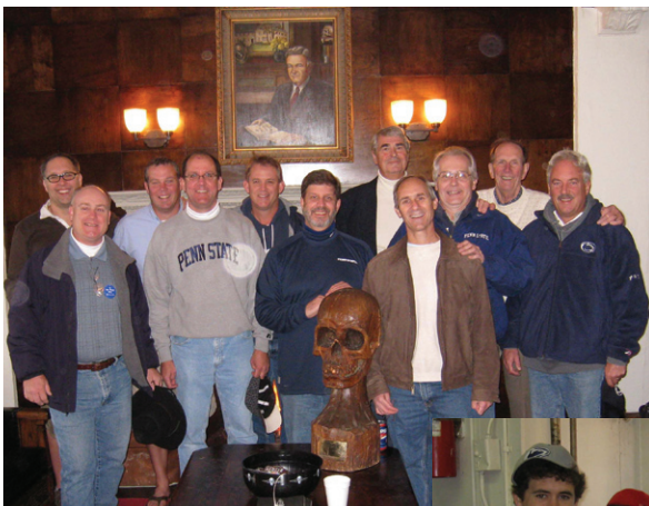
Left: Alumni who came back for Homecoming.