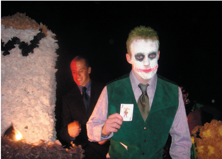
The undergraduates built a Batman-themed float for the Homecoming parade.

The new member class is 15 strong and dedicated to learning the traditions of the Psi Chapter. They are joining the 30 new Brothers and working to keep our GPA well above the all-Greek average.