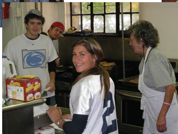
Right: Undergraduates and friends prepare brunch for alumni, along with our House cook.