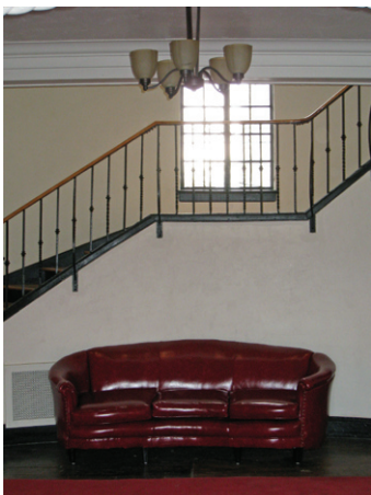
Big Red under the renovated Brotherhood stairs.

Visit www.psuskull.com to view full bios and photos of the pledge class!