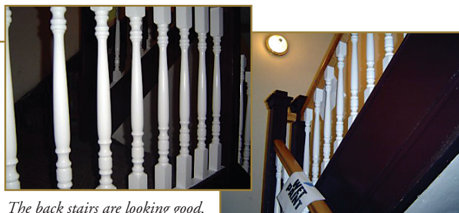
The back stairs are looking good.

To read the rest of this article about a true living legend, go to our Web site at www.psuskull.com .