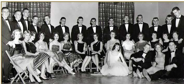
If you know the year or the event, please email psuskulls@hotmail.com . There is a larger picture on the web site.