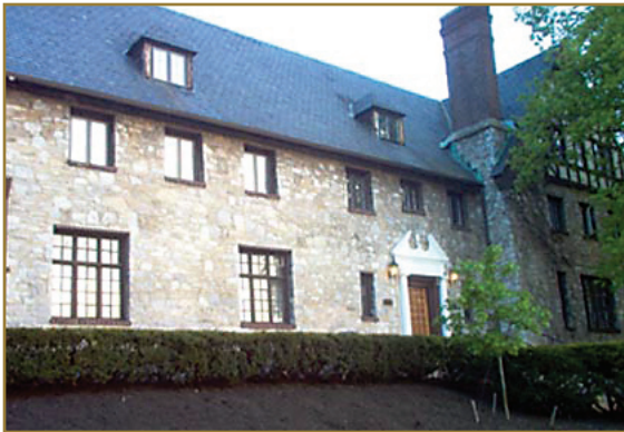
The house in May 2005, with new windows on the second and third floors.

Receive the monthly Penn State Skull House e-letter. Just send your name and e-mail address to psuskulls@hotmail.com , or go to www.psuskull.com and sign up there. You'll receive the latest Skull House news, including get-together updates, notification of the latest additions to the Web page and the Skull Photo of the Month.