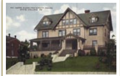
The House circa 1918.

days traveling by plane to get there and then return home. We saw whales, porpoises, lots of salmon and seabirds while underway. Glaciers were fascinating, and the mountain ranges with high peaks are outstanding. We saw moose and a black bear with two cubs when our group took a hike with a naturalist. We went through the Denali National Forest and saw more animals and birds. The Holland America cruise line did all the planning and scheduling from the time we left home