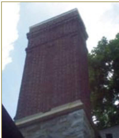
Picture of one of the redone chimneys

(2130 Pontiac Dr., Sylvan Lake, MI 48320-1762) I attended my 60th Allentown High