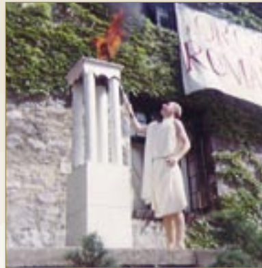
Left: Toga! Toga! The things we did in 1966...