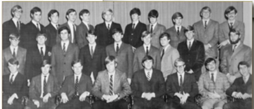
We all had a lot more hair in 1969.