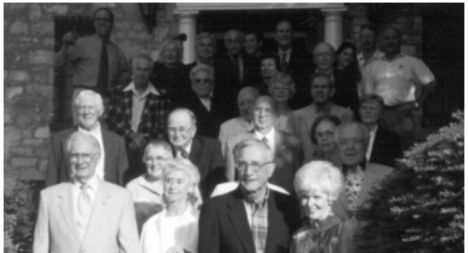
2002 War Years and All Class Reunion - on the House steps.