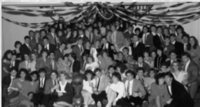
Phi Kappa Sigma Pledge Formal 1986. Do you know any of these faces?

Let's share the memories and get to know each other better. Our brotherhood is for life.