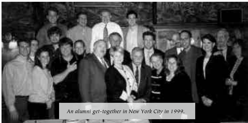
An alumni get-together in New York City in 1999.