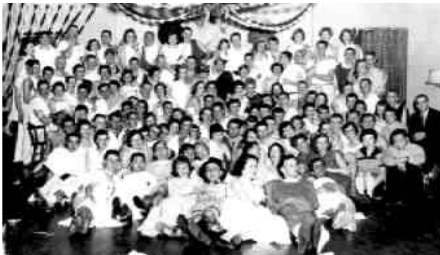
Phi Kappa Sigma Annual Dad's Day — April 25, 1964.

Can you help us identify who's in this photo? Please send names to Phi Kappa Sigma Fraternity, Alumni Records Office, P.O. Box 296, State College, PA 16804-0296.